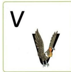
Down a wing, up a wing.